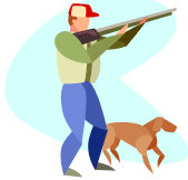
cazar to hunt