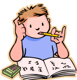
hacer la tarea to do homework