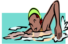
nadar to swim