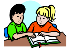
estudiar to study