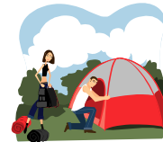
acampar to camp