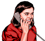
hablar to talk/speak