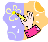
dibujar to draw