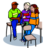
pasar tiempo con amigos to spend time w/ friends