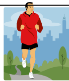
correr to run