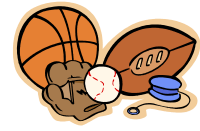
practicar deportes to play sports