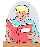
leer to read