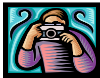
sacar fotos to take pictures