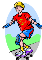
andar en patineta to ride a skateboard