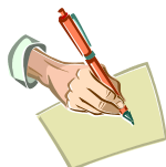
escribir to write