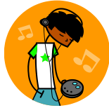
escuchar música to listen to (music)