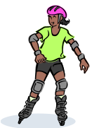
patinar en línea to (in line) skate