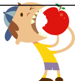
comer to eat