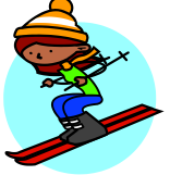
esquiar to ski