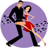
bailar to dance