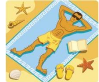
tomar el sol to sunbathe