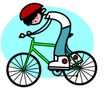
andar en bicicleta to ride a bike