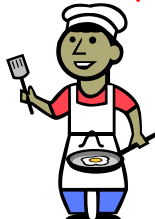
cocinar to cook