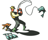
pescar to fish