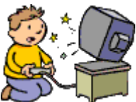
jugar a los videojuegos to play videogames