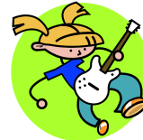
tocar un instrumento to play an instrument