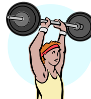
levantar pesas to lift weights