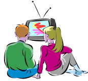
mirar la tele to watch tv